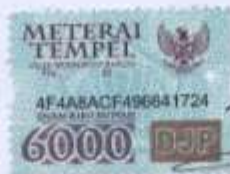
MARGANINGSI BETE BOU